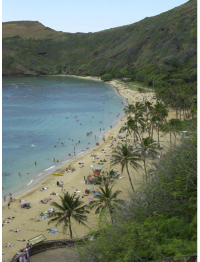
The beach at Hanauma Bay, Hawaii