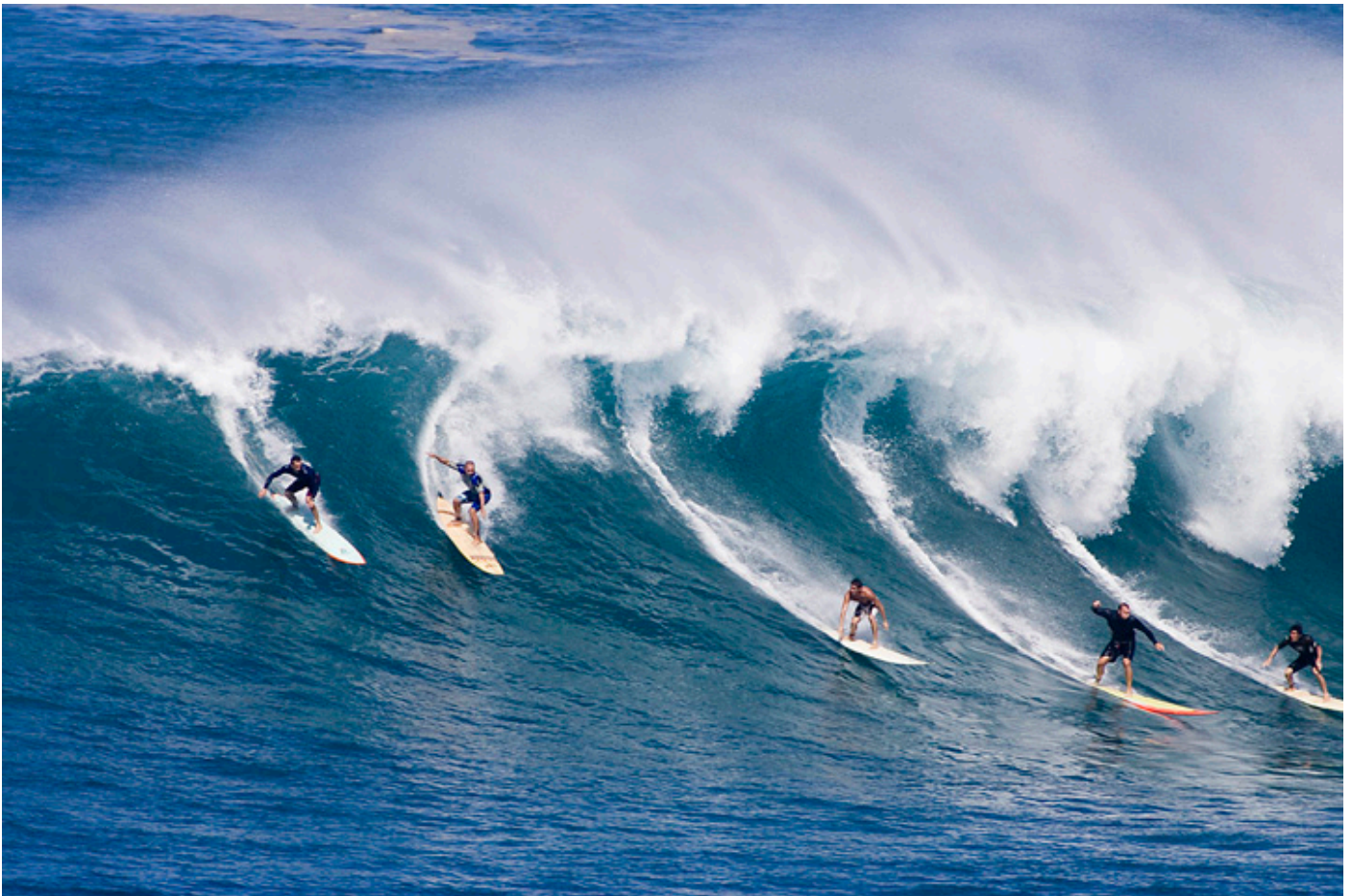
Surfers ride a wave at Waimea Beach on the North Shore of Oahu, Hawaii