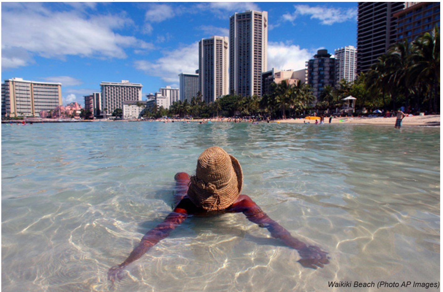
Waikiki Beach

Some of the most beautiful beaches include Lanikai Beach in Oahu, considered by many to be the best swimming beach in Hawaii, with a clean, wide beach protected by a reef, sparkling turquoise waters and swaying coconut palms, Hanalei Bay Beach on the island of Kauai with waterfalls and emerald mountain peaks in the background, Hanauma Bay in Oahu, a nearly circular bay, which is one of the most popular areas for snorkeling and swimming, Ke'e Beach Park in Kauai famous for spectacular sunsets, and Kapalua Bay Beach in Maui with abundant golden sand and swaying palms.