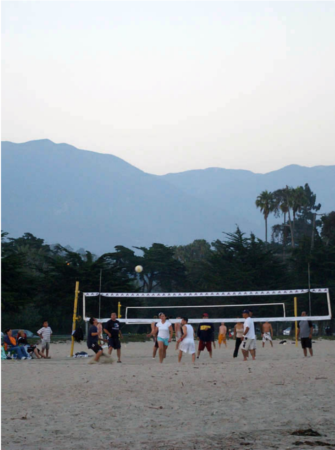
The beach in Santa Barbara