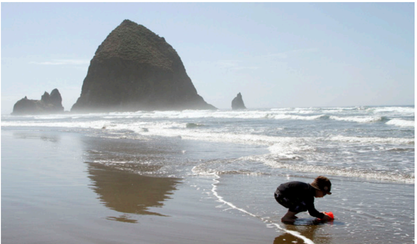
Haystack Rock in Cannon Beach, Oregon

To entice more tourists to visit Clatsop County, the local community organizes events such as the Annual Sand Castle Contest, summer music concerts, which are held in the downtown City Park, book sales, and Independence Day parades.