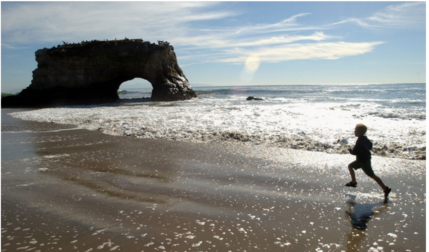
Natural Bridges State Beach in Santa Cruz, California