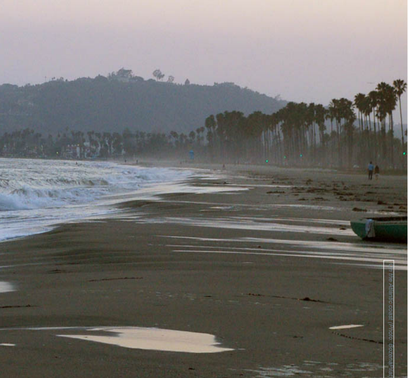
On the Atlantic coast