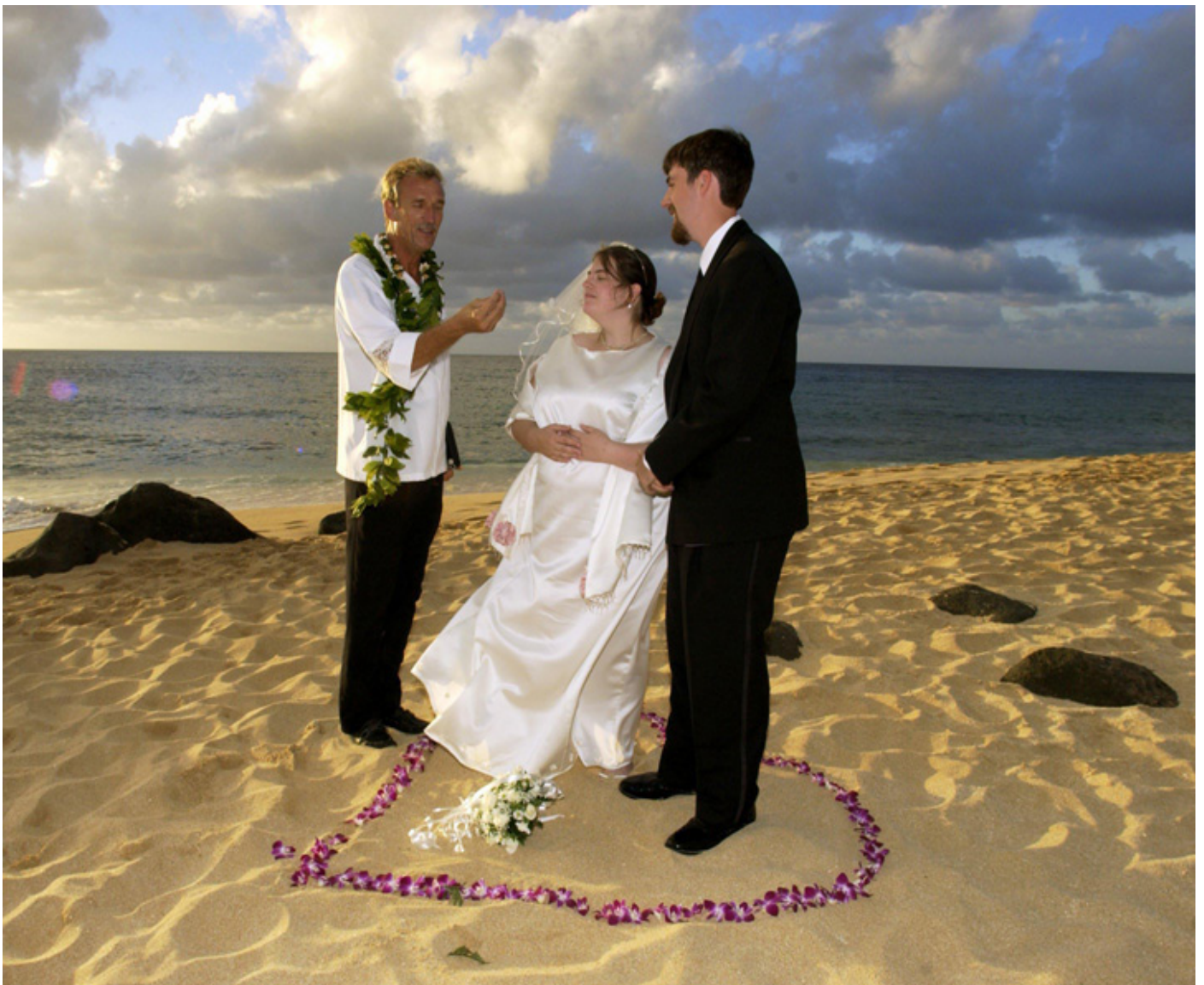
Marriage ceremony at Banzai Pipeline beach on Oahu's north shore in Honolulu