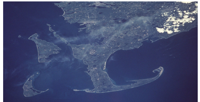
This is a June 1998 NASA handout photo showing Cape Cod, the island of Martha's Vineyard, left, and the island of Nantucket, left-bottom, in a view from space. U.S. Census figures for Massachusetts released Wednesday, March 21, 2001, showed that growth on Cape Cod and the two islands outpaced areas in the rest of the state, and Nantucket was the fastest growing county.