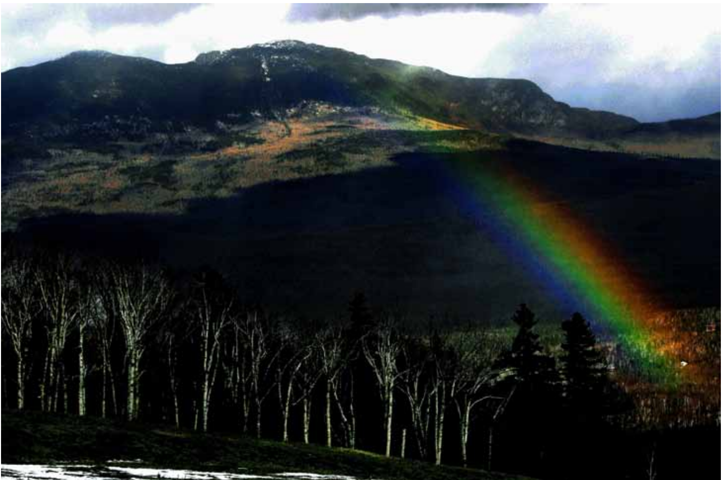
A rainbow spreads across the valley below Bigelow Mountain which is across from Sugarloaf Mountain in Carrabassett Valley, Maine.

The state fish is the Landlocked Salmon, a freshwater form of the sea-going Atlantic salmon. Before 1868, salmon