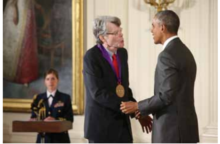
President Barack Obama awards the 2014 National Medal of Arts to author Stephen King on September 10, 2015, during a ceremony in the East Room at the White House in Washington.

And among the dreams of the days that were, I find my lost youth again. And the strange and beautiful song, The groves are repeating it still: "A boy's will is the wind's will, And the thoughts of youth are long, long thoughts."