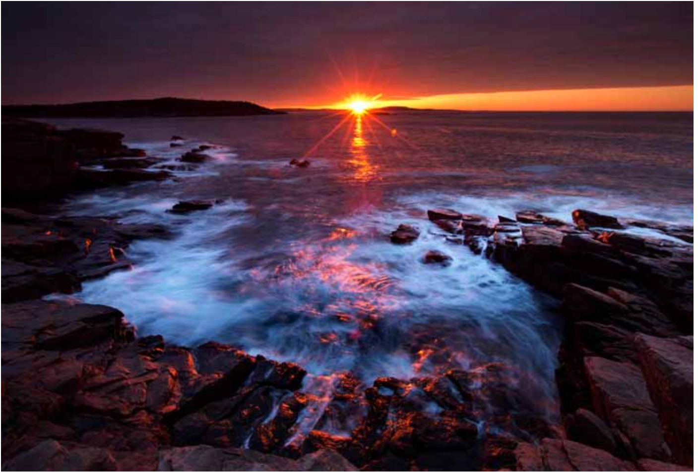
The sun's rays strike the rocky coast of Acadia National Park, in Maine.