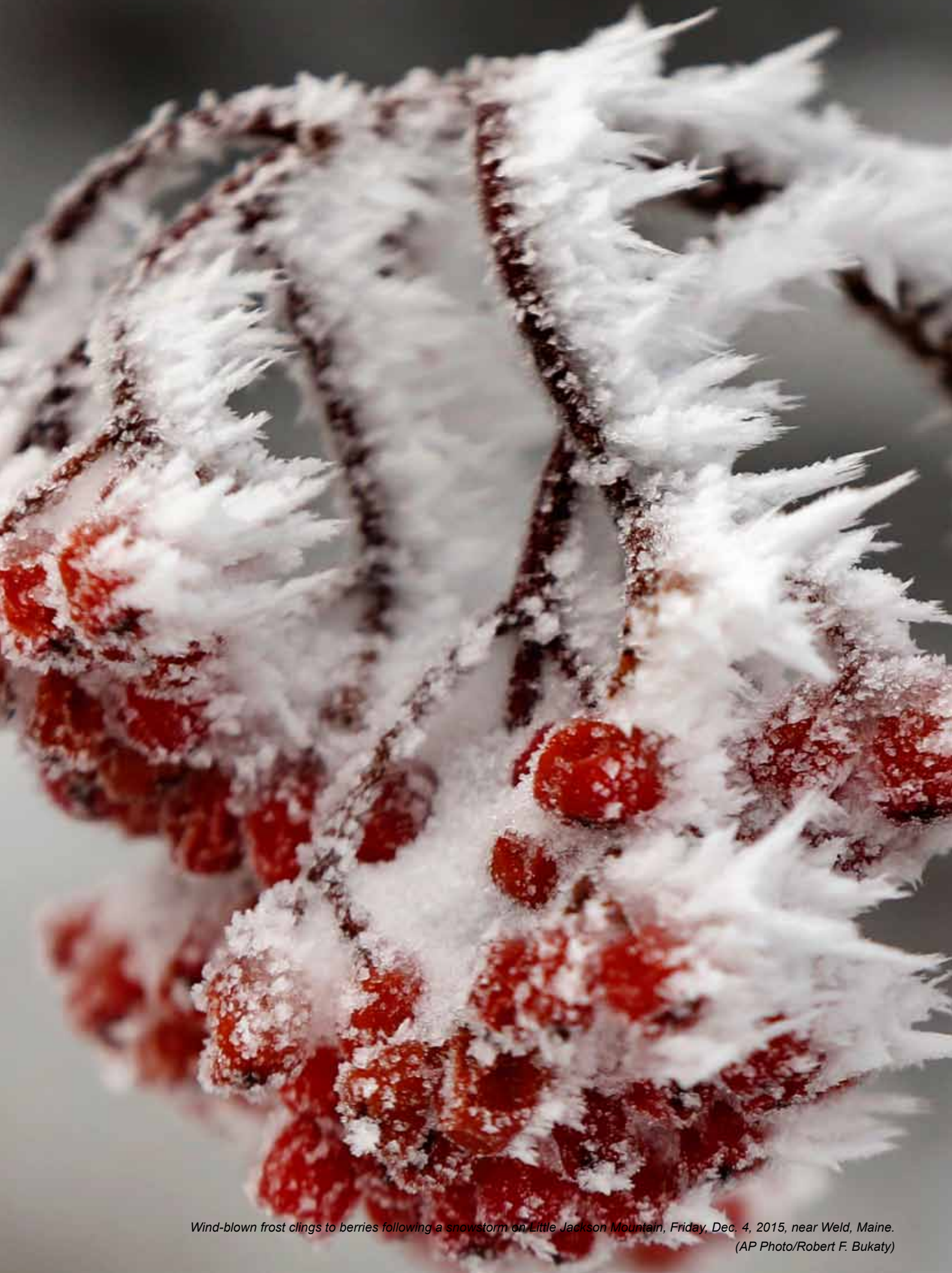
Wind-blown frost clings to berries following a snowstorm on Little Jackson Mountain, Friday, Dec. 4, 2015, near Weld, Maine.