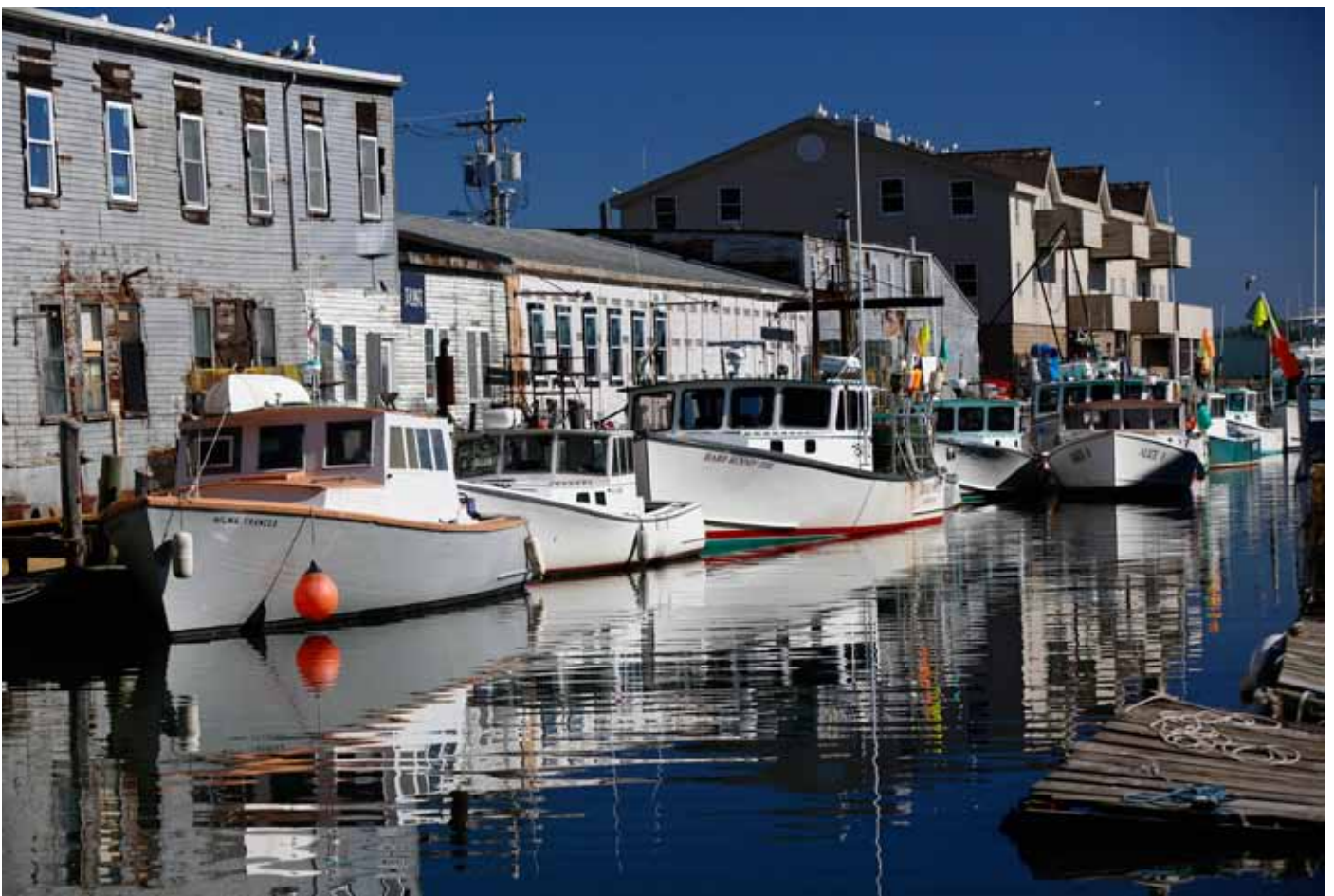
Lobster boats are tied up at a wharf on the waterfront in Portland, Maine.