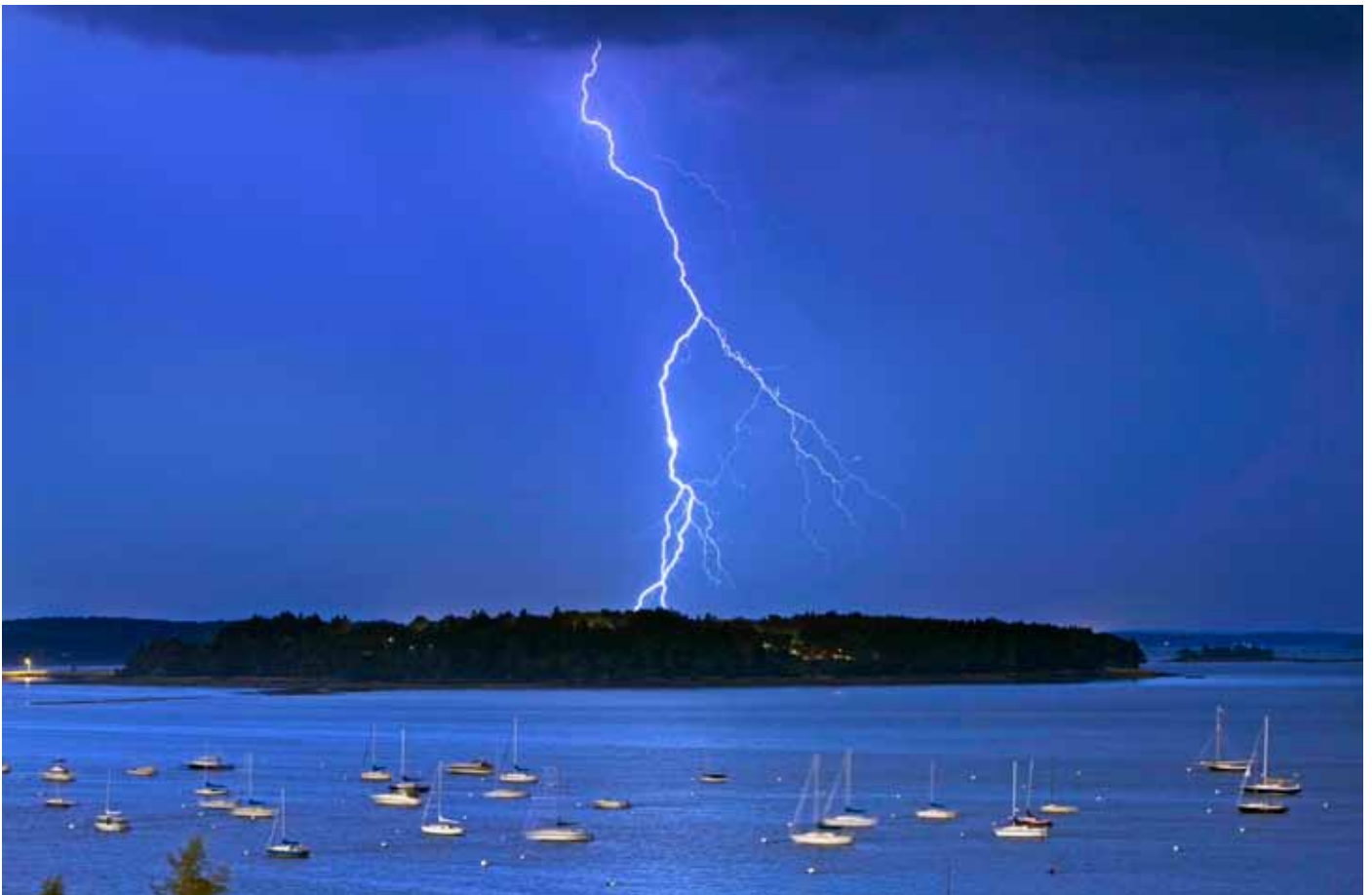
Lightning strikes north of Macworth Island in Portland, Maine.