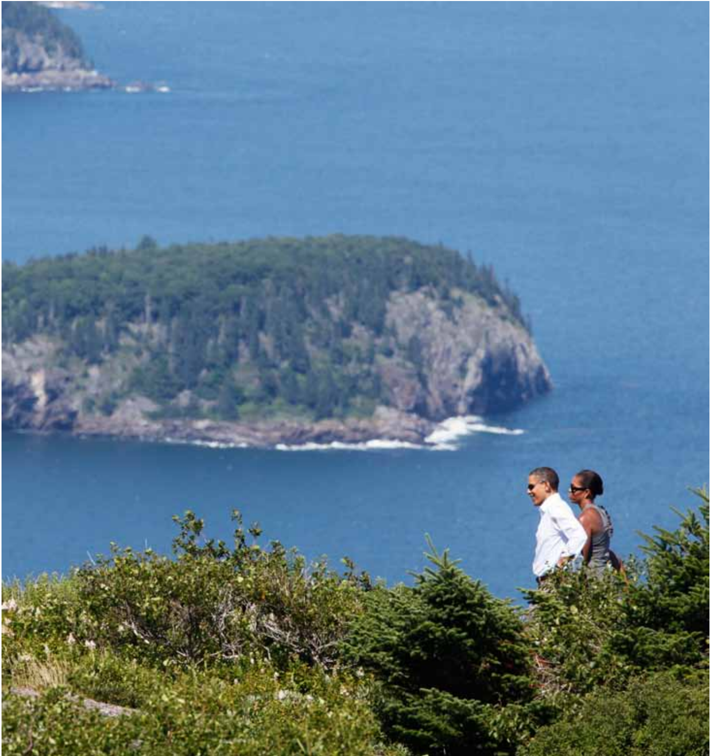
President Barack Obama, first lady Michelle Obama visit Cadillac Mountain in Acadia National Park, Bar Harbor, Maine, July 16, 2010.