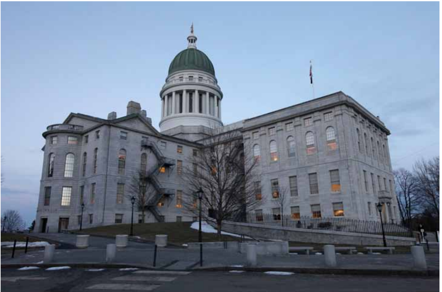
The Statehouse in Augusta, Maine.