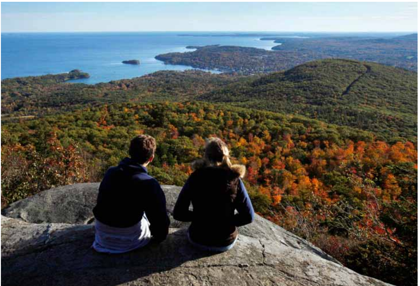
A couple taking in the view from the ocean lookout ledges on 1375-foot Mount Megunticook at Camden Hills State Park in Camden, Maine.

After the American Revolution Maine was part of the Commonwealth of Massachusetts, until 1820 when it seceded from Massachusetts and became the 23rd state of the United States on March 15, 1820.