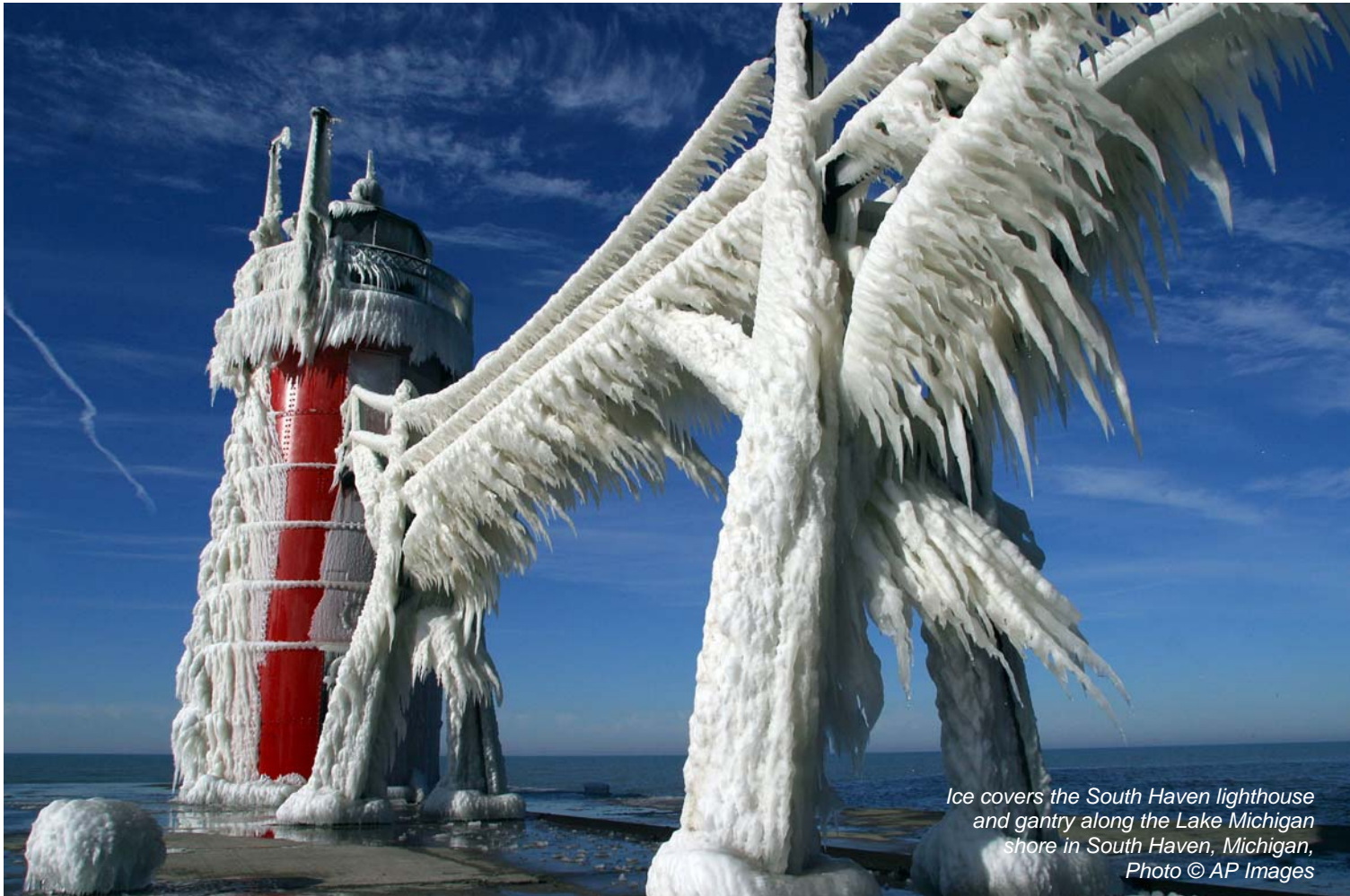
Ice covers the South Haven lighthouse and gantry along the Lake Michigan shore in South Haven, Michigan

all. Rivers and channels connect the lakes: the St. Mary's River connects Lake Superior to Lake Huron; the St. Clair River, St. Clair Lake, and the Detroit River connect Lake Huron to Lake Erie; the Niagara River (with Niagara Falls) connects Lake Erie to Lake Ontario. The border between the U.S. and Canada runs down the middle of Lake Erie. The Great Lakes greatly affect the weather, climate, and the way of life of the inhabitants of the 10 states and provinces that they touch. The states and provinces include: Illinois, Indiana, Michigan, Minnesota, New York, Ohio, Ontario, Pennsylvania, Quebec, and Wisconsin. In this issue of Zoom in on America we will take a closer look at some of the lighthouses that have guarded the 10,500 miles (16,900 km) of coast that make up the Great Lakes.