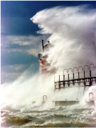
The South Haven, Michigan, Photo © AP Images