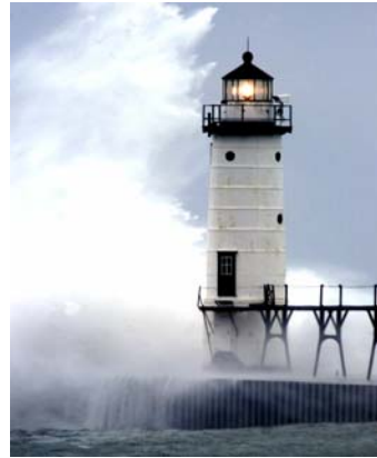
Manistee, Michigan, north pier light, Photo © AP Images