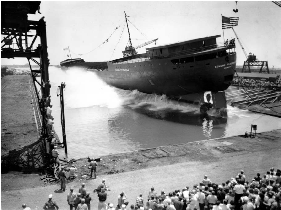
The largest and longest vessel ever built on the Great Lakes, the 729-foot ore carrier SS Edmund Fitzgerald, slides into the launching basin, on June 7, 1958, in Detroit, Michigan.

The Great Lakes have never been easy to navigate. The fall months, October through December, have frequent storms, with the waves reaching a height of ten meters at times. There was such a severe storm on Lake Superior on November 10, 1975 that the largest ship to have ever sailed the Great Lakes at the time, the Edmund Fitzgerald , sank within seconds.