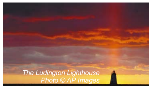
The Ludington Lighthouse