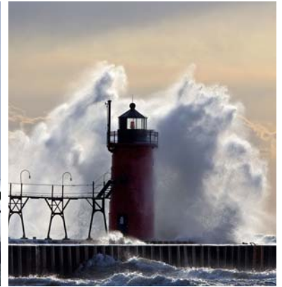
Pier and lighthouse in South Haven, Michigan

The dictionary describes a lighthouse as a tower or other structure containing a beacon of light to warn or guide ships at sea. What sight is more reassuring for seamen than a streak of light amidst the night waters of unknown seas? What sound is more welcome than the distant echo of a fog horn in a dense mist? Indeed, lighthouses have always been sailors' best friends.