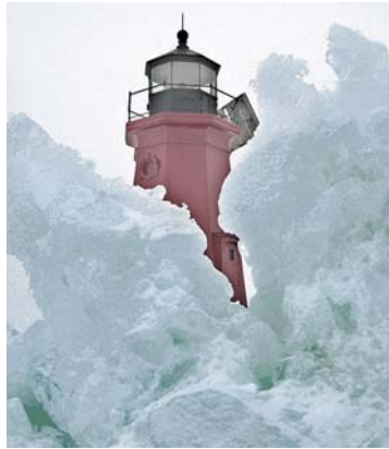
The lighthouse in Menominee, Michigan, Photo © AP Images