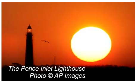
The Ponce Inlet Lighthouse

The good purpose lighthouses serve by assisting ships in bad weather, guiding them safely to ports, and warning them against shallow waters and treacherous rocks has warmed people's hearts to them for centuries. The image of a lighthouse against tranquil waters is as much spectacular as it is inspirational.