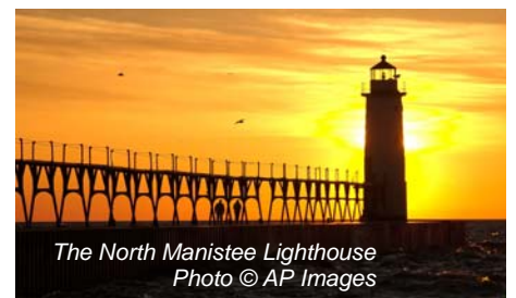
The North Manistee Lighthouse